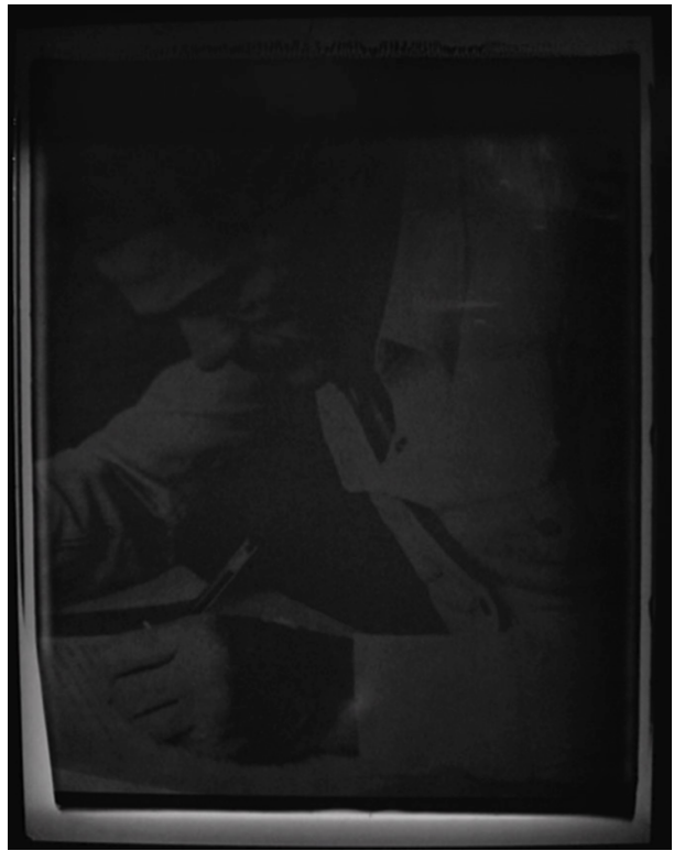
Figure 1 (Left): Vogar Eloquio (John Di Stefano, 2005). Digital video projection. Senza Parole (2005). Digital video and mixed media. Figure 2 (Right): Tenebre (John Di Stefano, 2005). Polaroid photographic prints (42cm x 52cm each. Series of four images. Edition of 1).