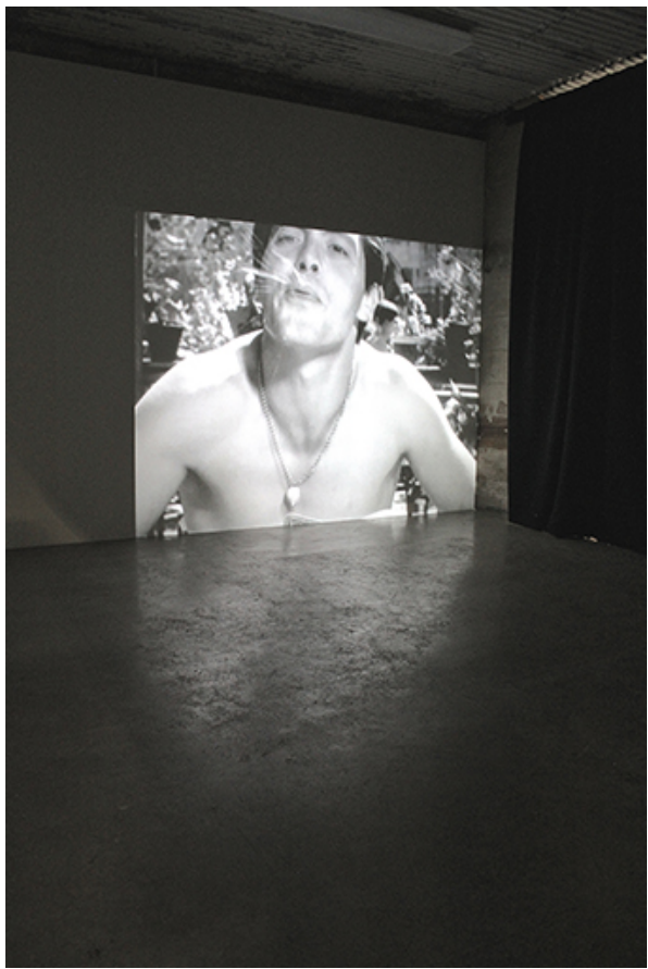
Figure 4 (Left): Theorem (John Di Stefano, 2005). Digital video, photography and mixed media. Figure 5 (Right): Punto (John Di Stefano, 2013). Digital video.

As with museums and archaeological sites, the pieces, artefacts and artworks become interrelated, their meanings bleeding into one another. As one looks at Gram/sci , or up at the red light, one hears a voice echoing. The work, entitled Silence Please (2013), is an audio recording from the Pantheon in Rome. We hear the sounds of tourists jostling and hushed voices, and a recording of a voice instructing everyone to remain silent in five different languages. The work establishes a subtle sense of coercion as well as an experience of reverence. We are in a museum, amidst archaeological remains, hearing the movements of other human beings who have now, in the Derridean sense, become ghosts.